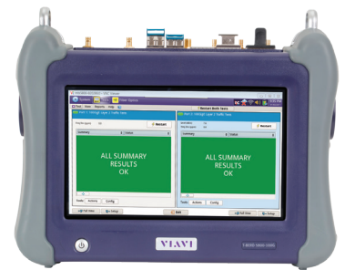
Figure 4. T-BERD/MTS 5800-100G

To test AOC and DAC cables, Viavi has introduced an integrated script to automate cable assembly testing. Viavi's T-BERD/MTS 5800-100G, shown in Figure 4, provides all-in-one testing at line rates up to 112Gbps. The 5800-100G supports all Ethernet rates with dual-port capabilities including 10/100/1000BASE-T, optical GE, 10GE, 25GE, 40GE, and 100GE. Technicians can test numerous applications including AOC/DAC cables in addition to metro, backbone, and data center interconnectivity. Although a small size, the 5800-100G can test from DS1/E1 to OTU4 including CPRI, Fiber Channel, PDH, SONET/SDH, OTN, and Ethernet. In addition, the 5800 platform expands to support OTDR modules, fiber inspection with auto-focus, and advanced timing and synchronization capabilities. These tools are all supported by StrataSync which provides cloud-based asset management, configuration, and reporting for easy management and sharing. The 5800-100G is a complete test and measurement solution to support the needs of the data center user in the data center, including AOC and DAC cable testing.