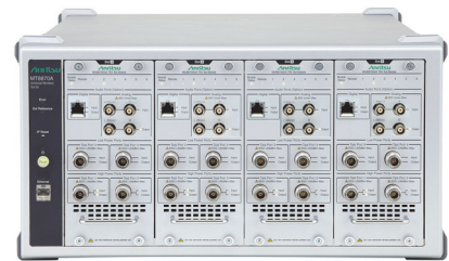
Universal Wireless Test Set MT8870A

The Universal Wireless Test Set MT8870A has four RF connection ports on a TRX test module. Test Port 1 and Test Port 2 are full duplex, while Test Port 3 and Test Port 4 are half duplex. The TRX test module has a Vector Signal Generator (VSG) and a Vector Signal Analyzer (VSA) connected to each RF port via a switch (Figure 1). All test ports are calibrated at the port edge.