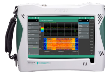
Field Master Pro MS2090A